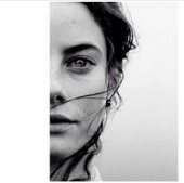
Cropped or Closure