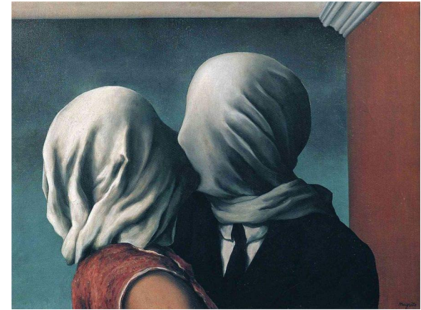
Renee Magritte The Lovers II 1928

The next slide breaks down content, composition and colour to help you write about the artwork as a whole. You could use this method to do your own example.