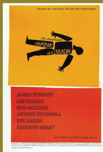
Saul Bass Anatomy of a Murder (1959)

This is an example of negative space because the woman is a silhouette, with artwork within her.